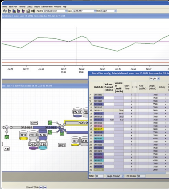
Graphical and tabular representations of tank activities